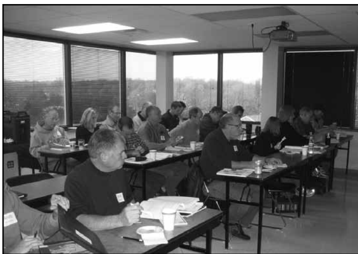
30 Builders, Remodelers, Interior Designers, Realtors and Green Build Council Members signed up for the two-day Green Building course.